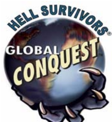
GLOBAL CONQUEST™ Y2K10 Real-Life Scenario June 26 th & 27 th , 2010