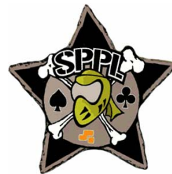
SPPL SCENARIO CHALLENGE Regional Qualifier August 21 st & 22 nd , 2010

THE GREATEST GAMES ON EARTH! Only @ HELL SURVIVORS PAINTBALL PLAYFIELD Pre-Register On-Line Now! HellSurvivors.com