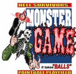
MONSTER GAME® 2 Big Days July 24 th & 25 th , 2010