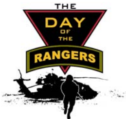
THE DAY OF THE RANGERS 12-Hour Real-Life Scenario May 9 th , 2009