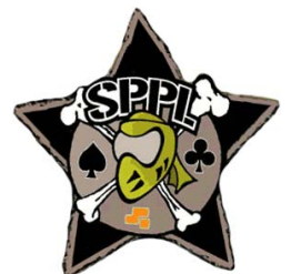
SPPL SCENARIO CHALLENGE Regional Qualifier August 22 nd & 23 rd , 2009

THE GREATEST GAMES ON EARTH! Only @ HELL SURVIVORS PAINTBALL PLAYFIELD Pre-Register On-Line Now! HellSurvivors.com