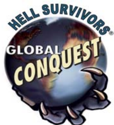
GLOBAL CONQUEST™ Y2K9 Real-Life Scenario June 27 th & 28 th , 2009